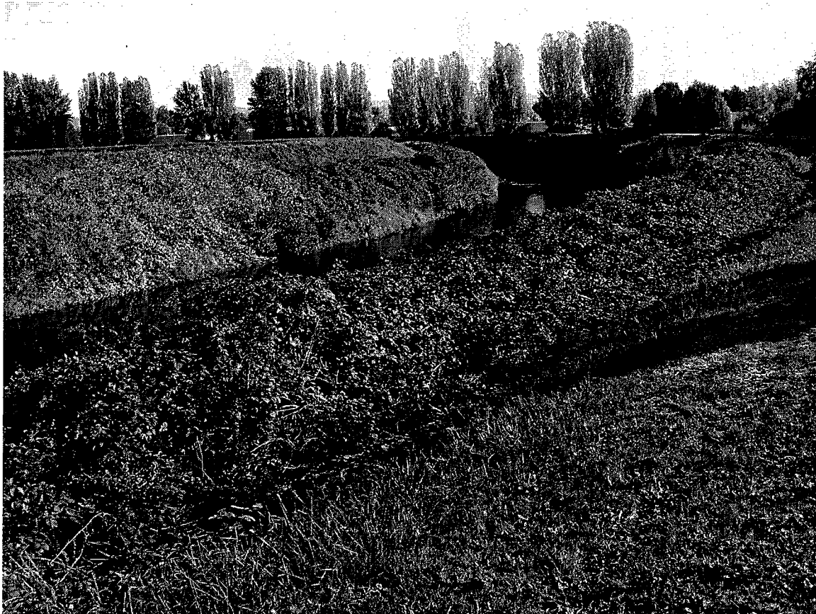
Green River, King County, WA Briscoe School Levee